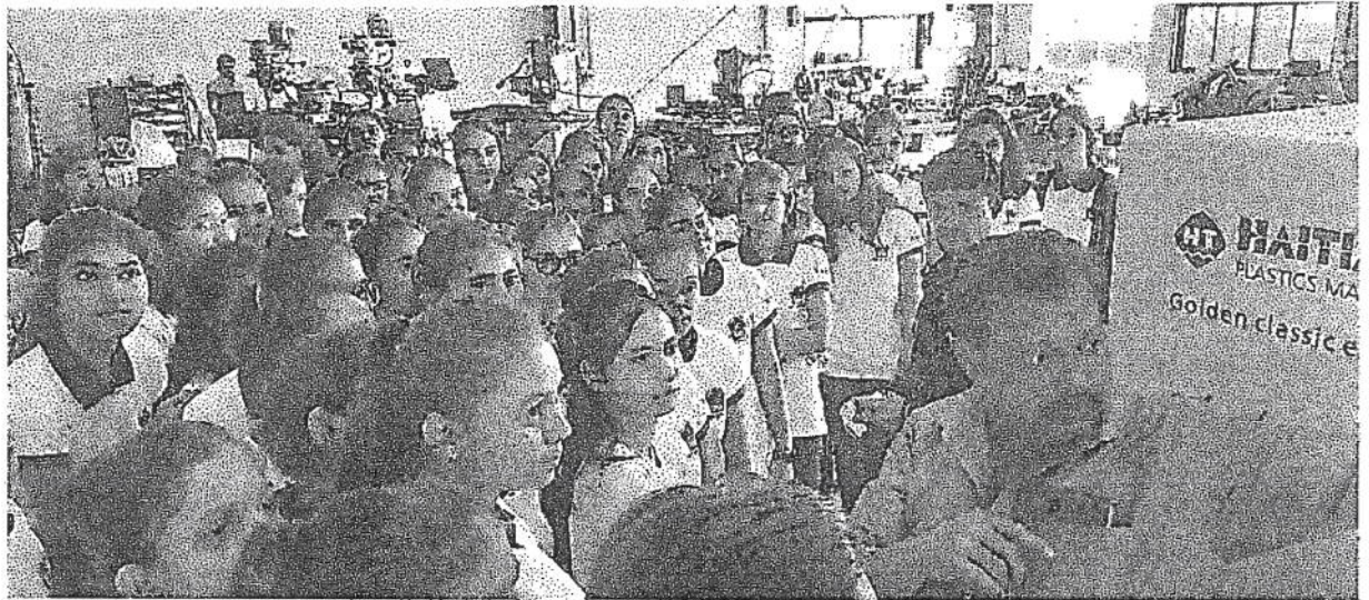
Staff of Nitiraj Ind while instructing to the students about the sections of the industry.