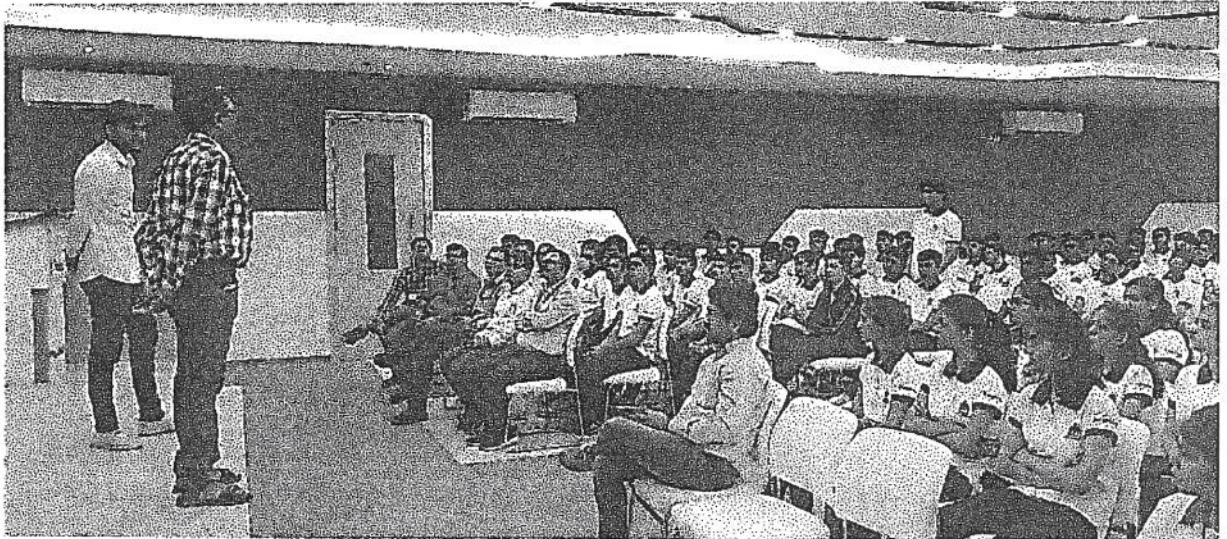
Visiting students interact with staff at Nitiraj Ind.